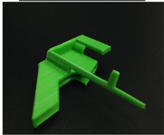
Image 1: Representative photograph of standard device by 3D printing (FDM method). Image2: Digital illustrative image simulating the use of the device in a patient.

Universidade de São Paulo Faculty of Odontology