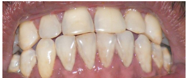
Tobacco stains removed in 7 days. Twice a day usage of toothbrite Natural Whitening Tooth Scrub

When the Tooth Scrub is used with Dentist micro motor brush it cleans teeth instantly