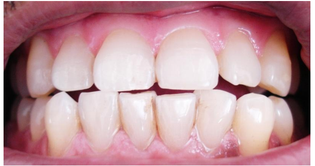
Single application Stains & Plaque cleaned with toothbrite Natural Whitening Tooth Scrub