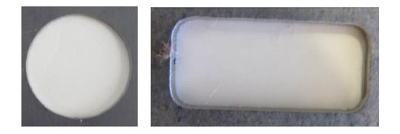
Figure 3 results of BIM Fast Contour cutting

Optimization of logistics and reduction of line layout footprint is a result of this new approach to cutting of press hardened steel.