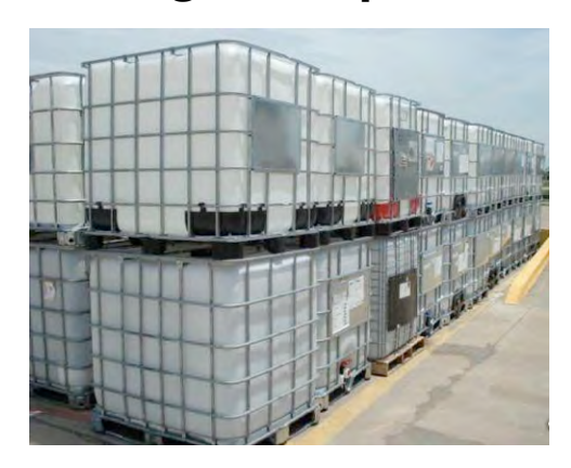
Origin, Destination, & Route Information

From Irving, Texas 75061 to Richmond, Virginia 22220