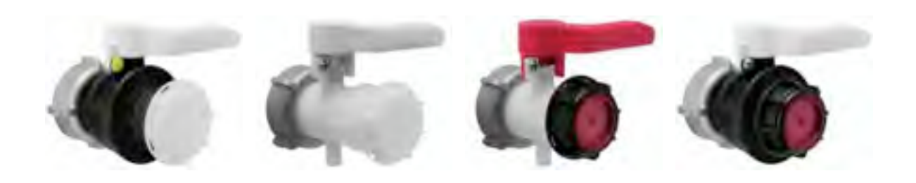
Schutz 2" Ball. Quick Connect Tote Valve